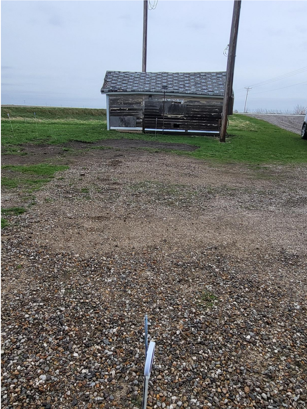
Figure 2 Looking north showing east side building footprint