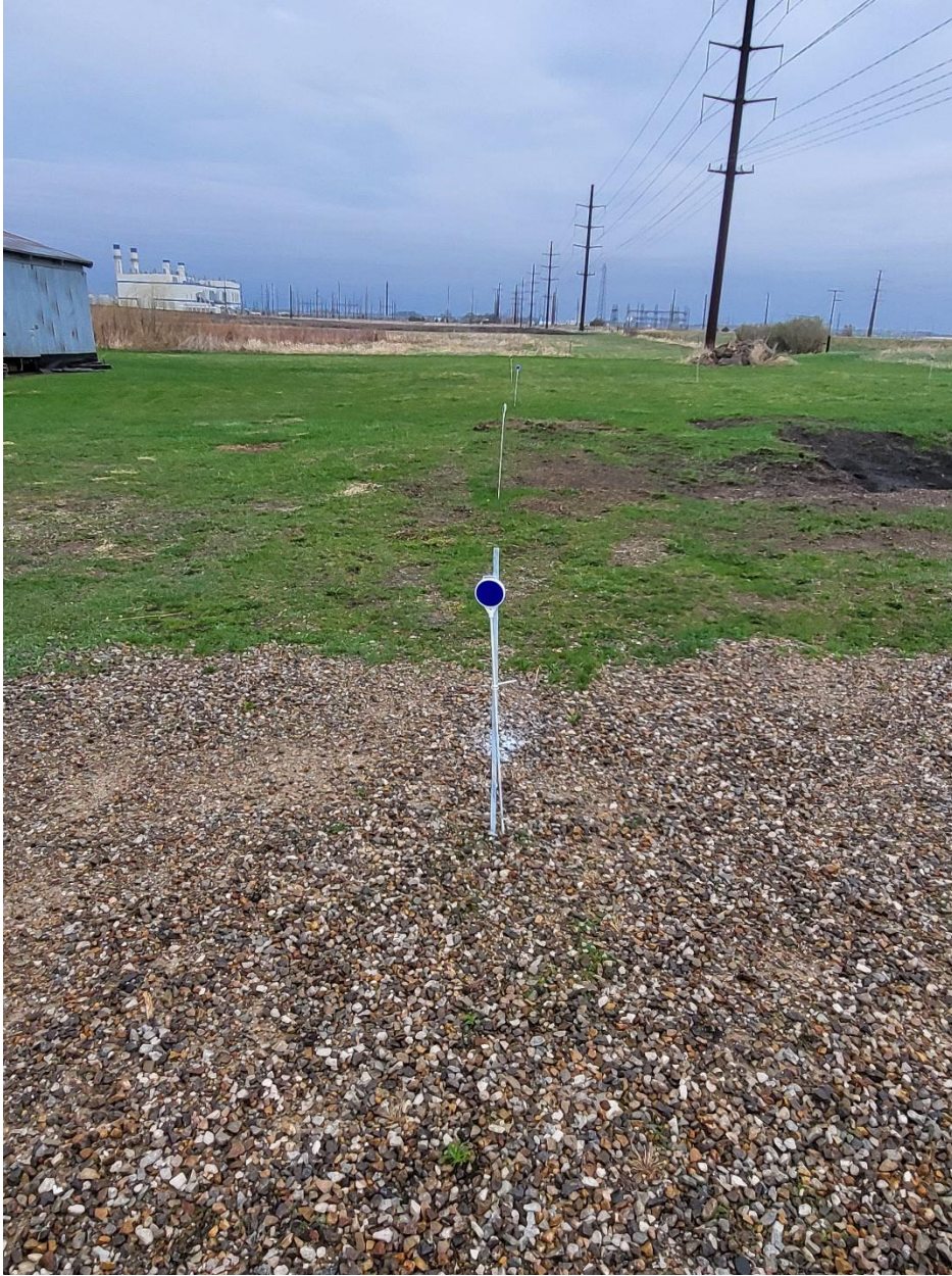
Figure 1 Looking west showing north side building footprint