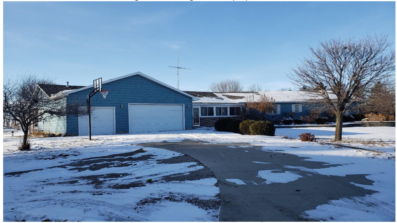
December 18, 2019, J. Robbins

Union Addition, Cerro Gordo County, Iowa Includes 7442 Balsam Avenue Figure 1 Looking at the existing house on proposed Lot 1