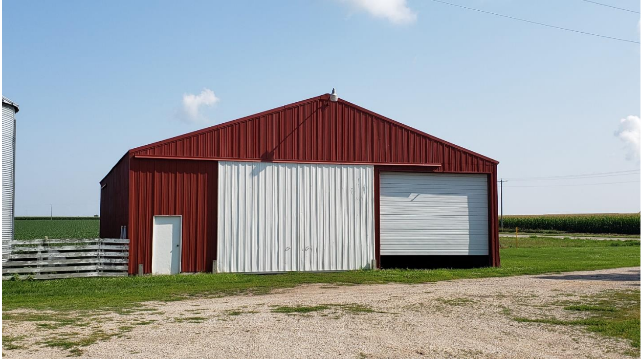
Figure 3 Looking at the existing machine shed