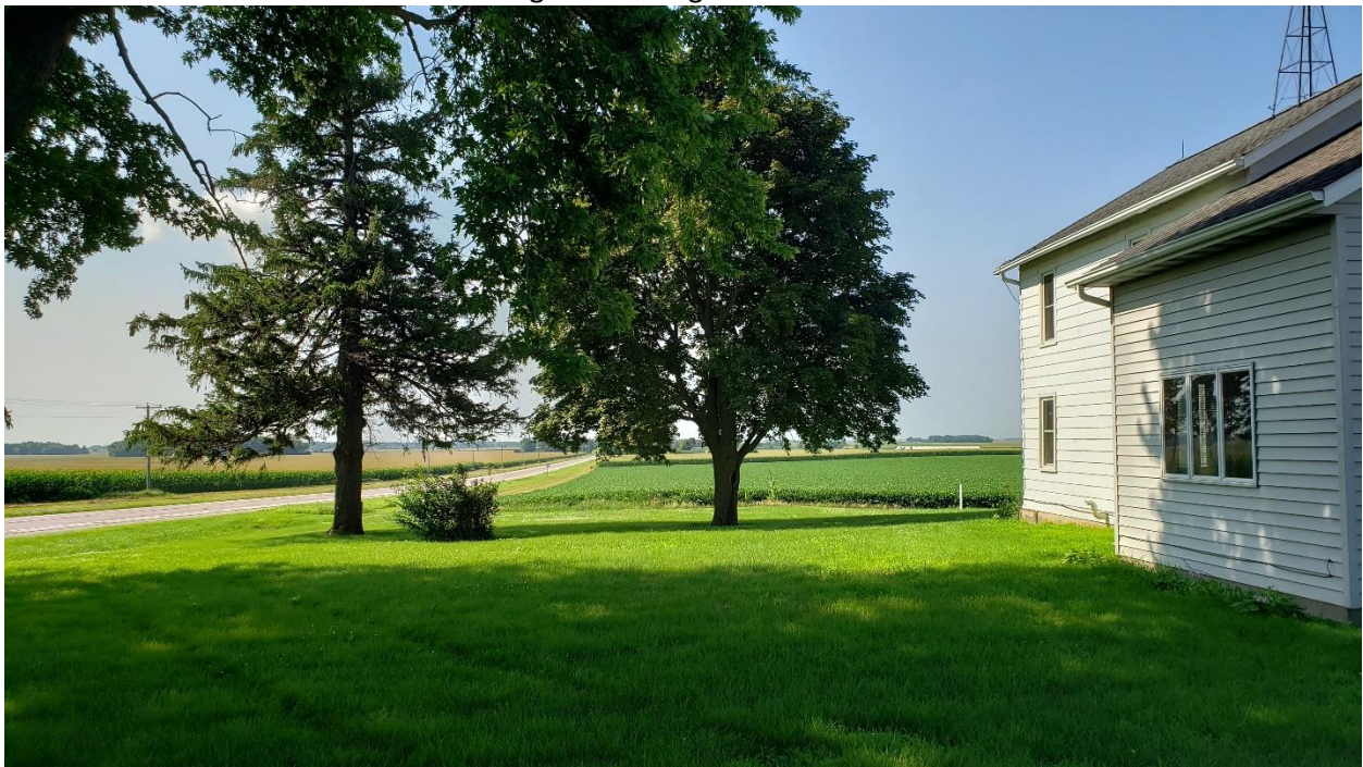
Figure 4 Looking south along the front lot line