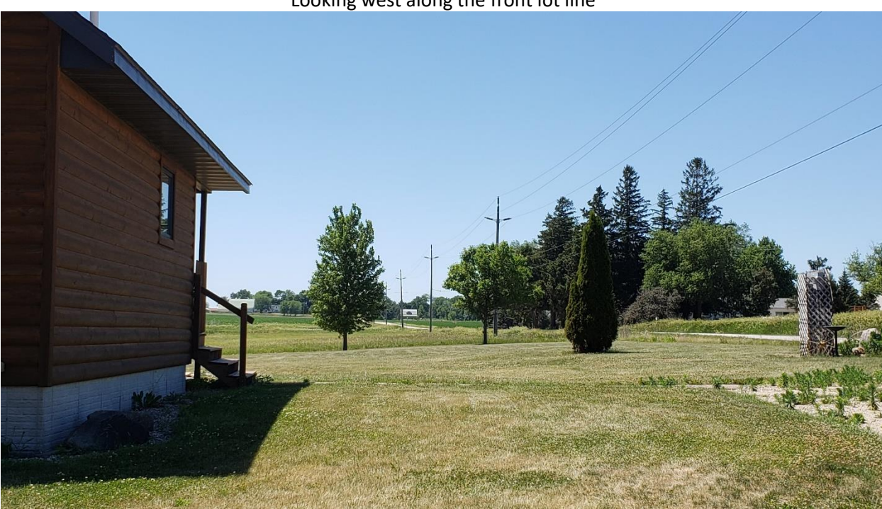
Figure 3 Looking west along the front lot line