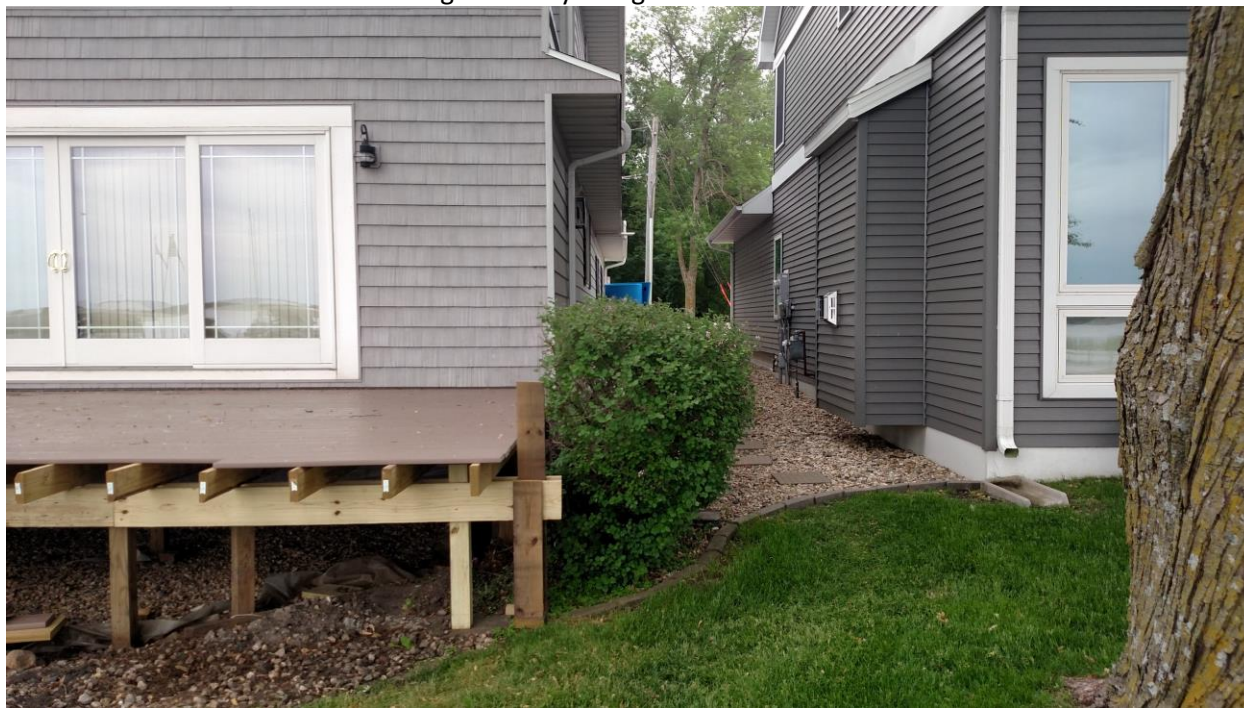
Figure 2 Looking southerly along the west side lot line