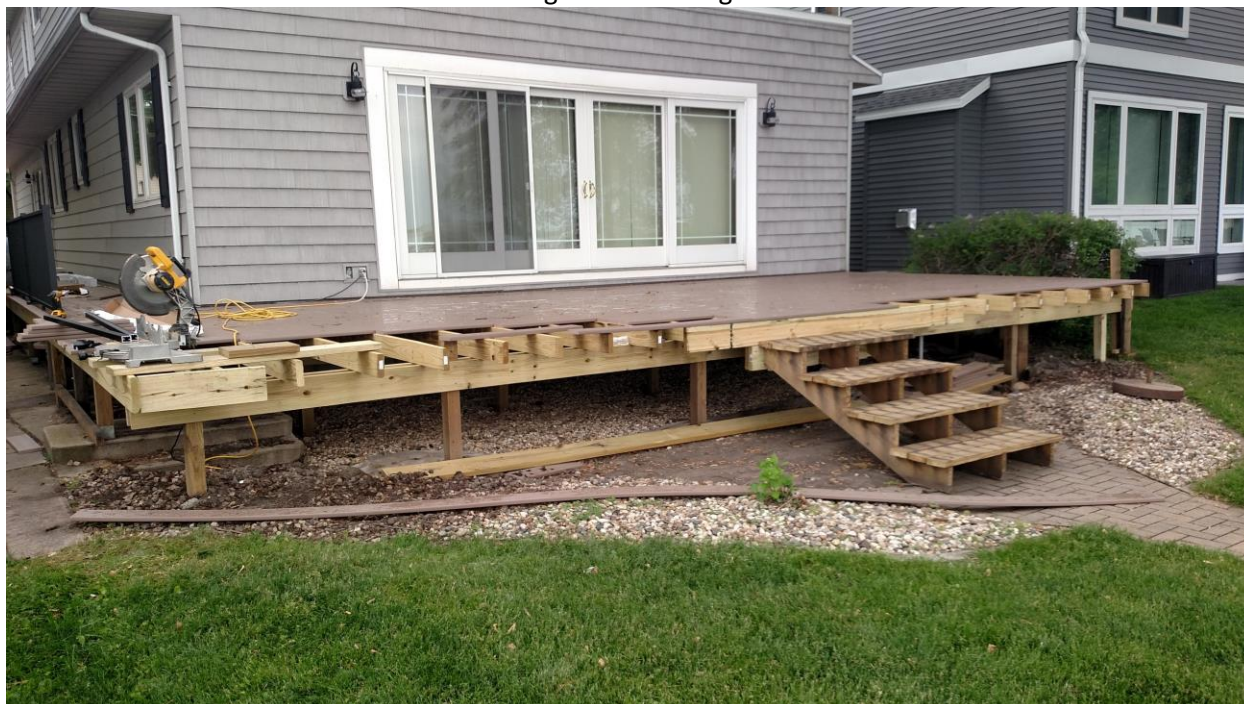
Figure 1 Looking at the existing deck