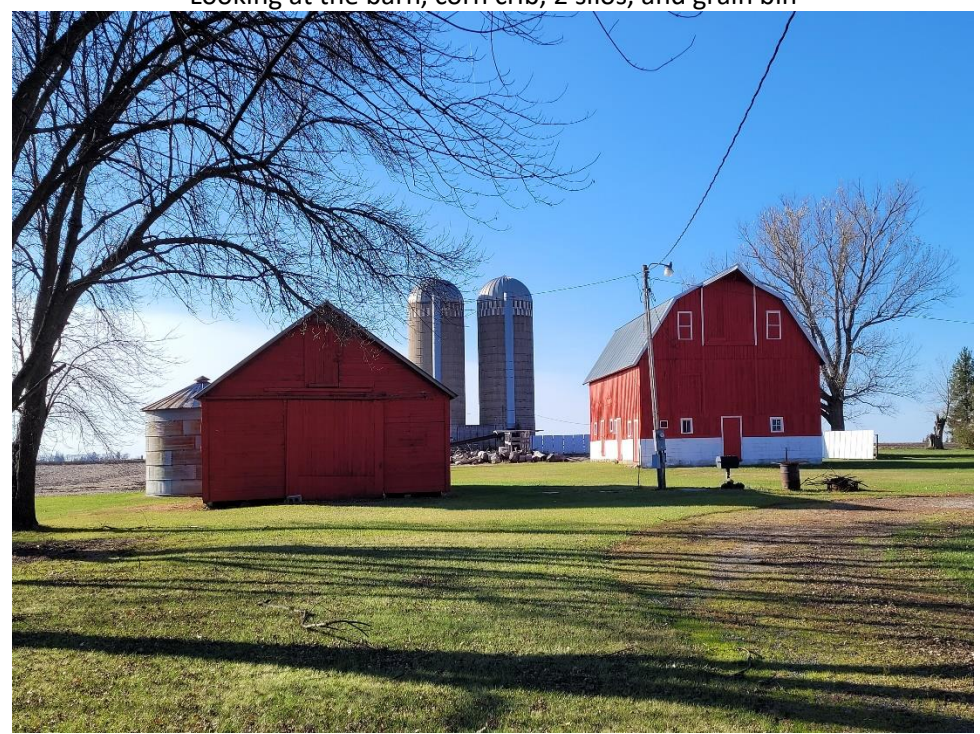
Figure 2 Looking at the barn, corn crib, 2 silos, and grain bin