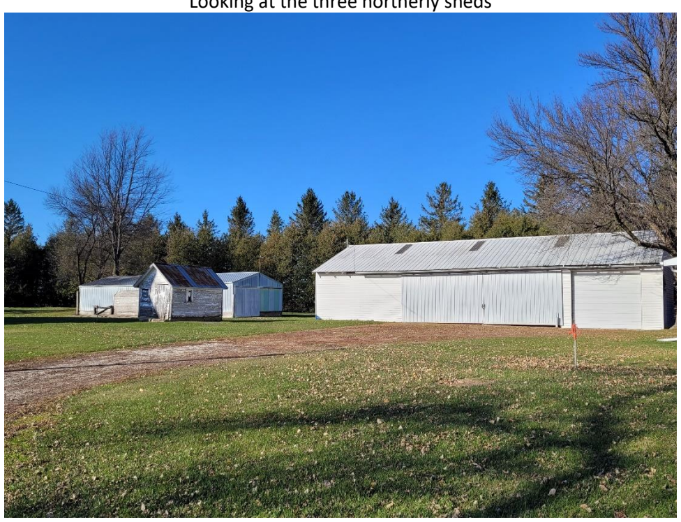
Figure 3 Looking at the three northerly sheds