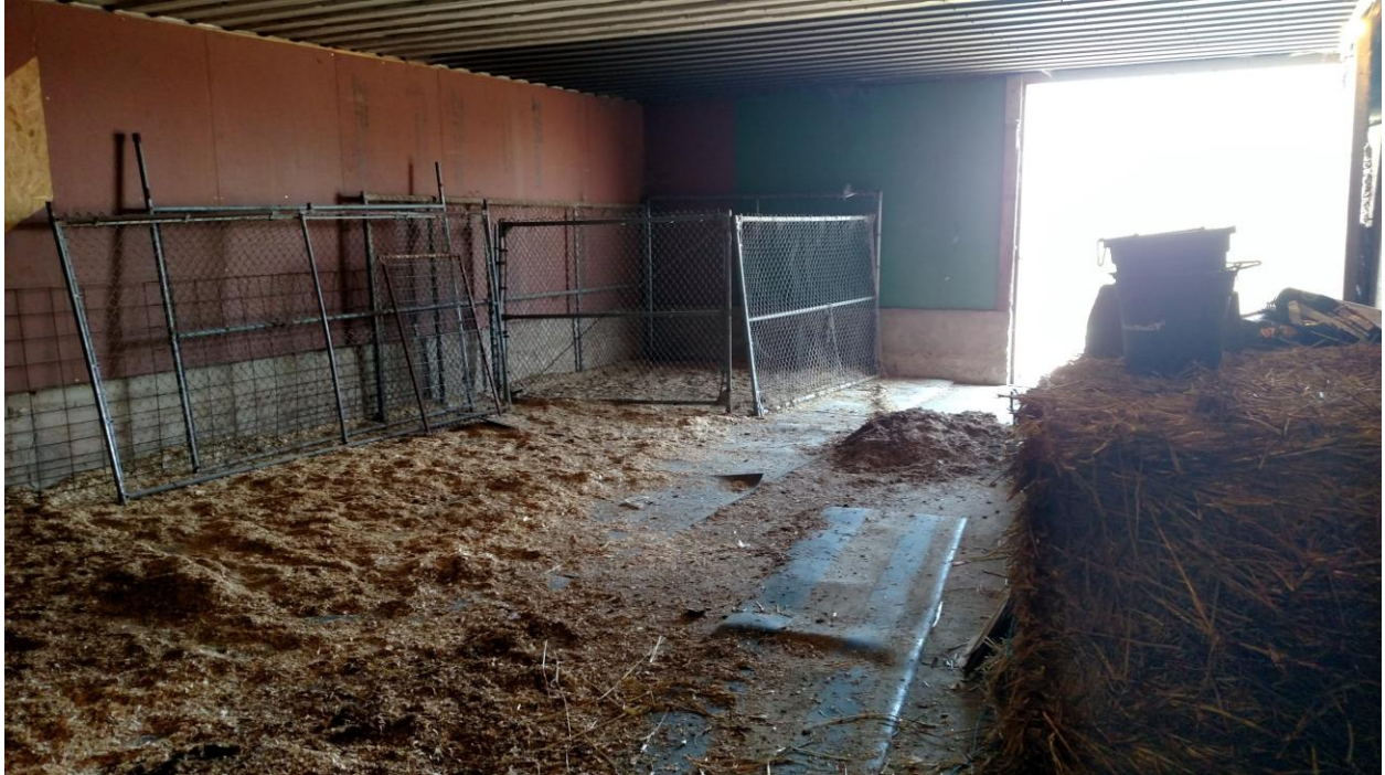
Figure 5 Looking at the back half inside the north kennel building