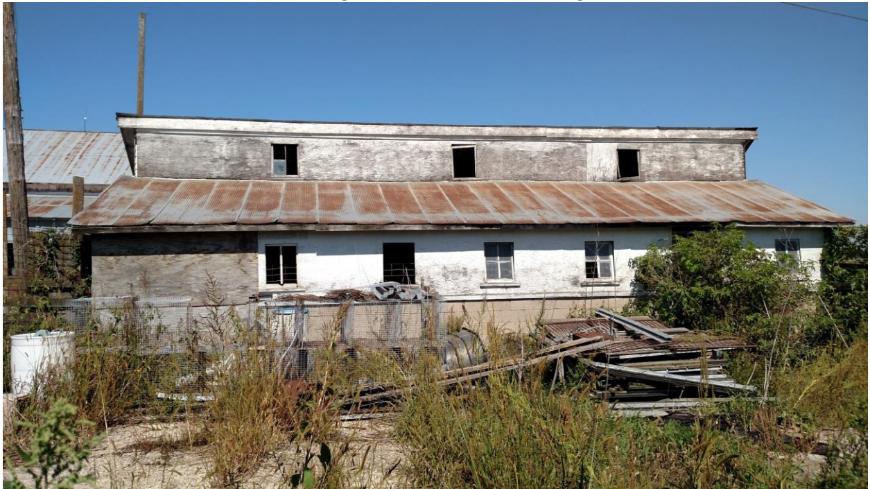
Figure 6 Looking at the south kennel building