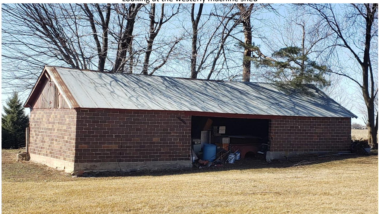
March 11, 2021