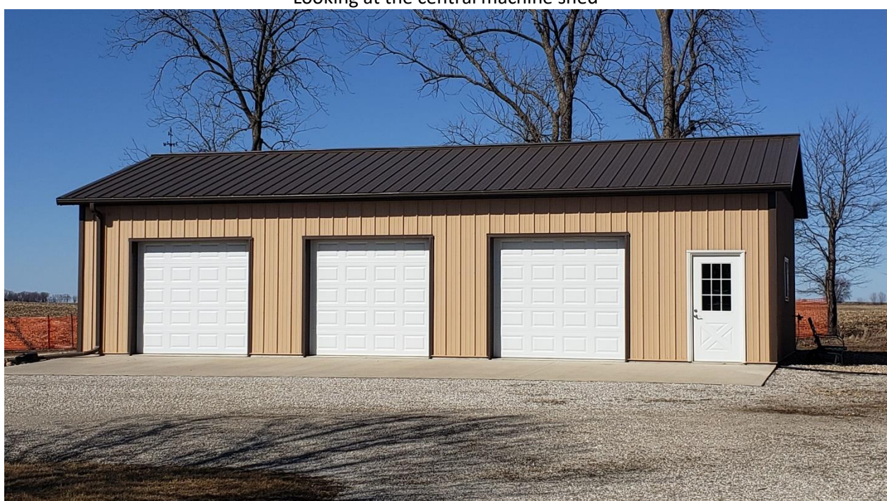
Figure 4 Looking at the central machine shed