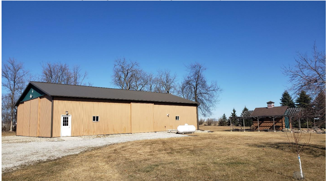
Figure 3 Looking at the garden shed and pergola and easterly machine shed