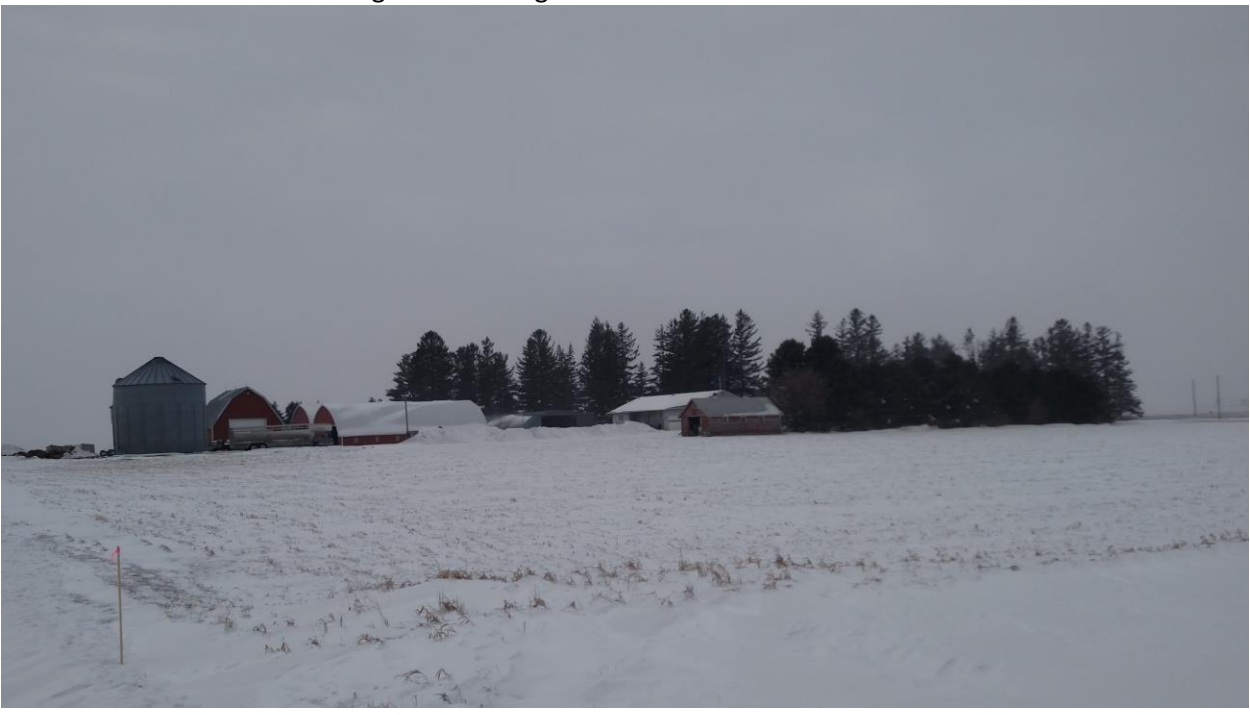
Figure 4 Looking at the acreage to the north from Nettle Avenue