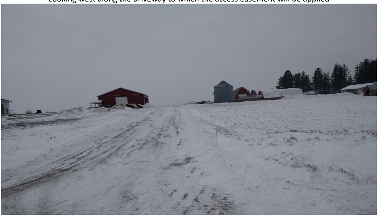
Figure 3 Looking west along the driveway to which the access easement will be applied