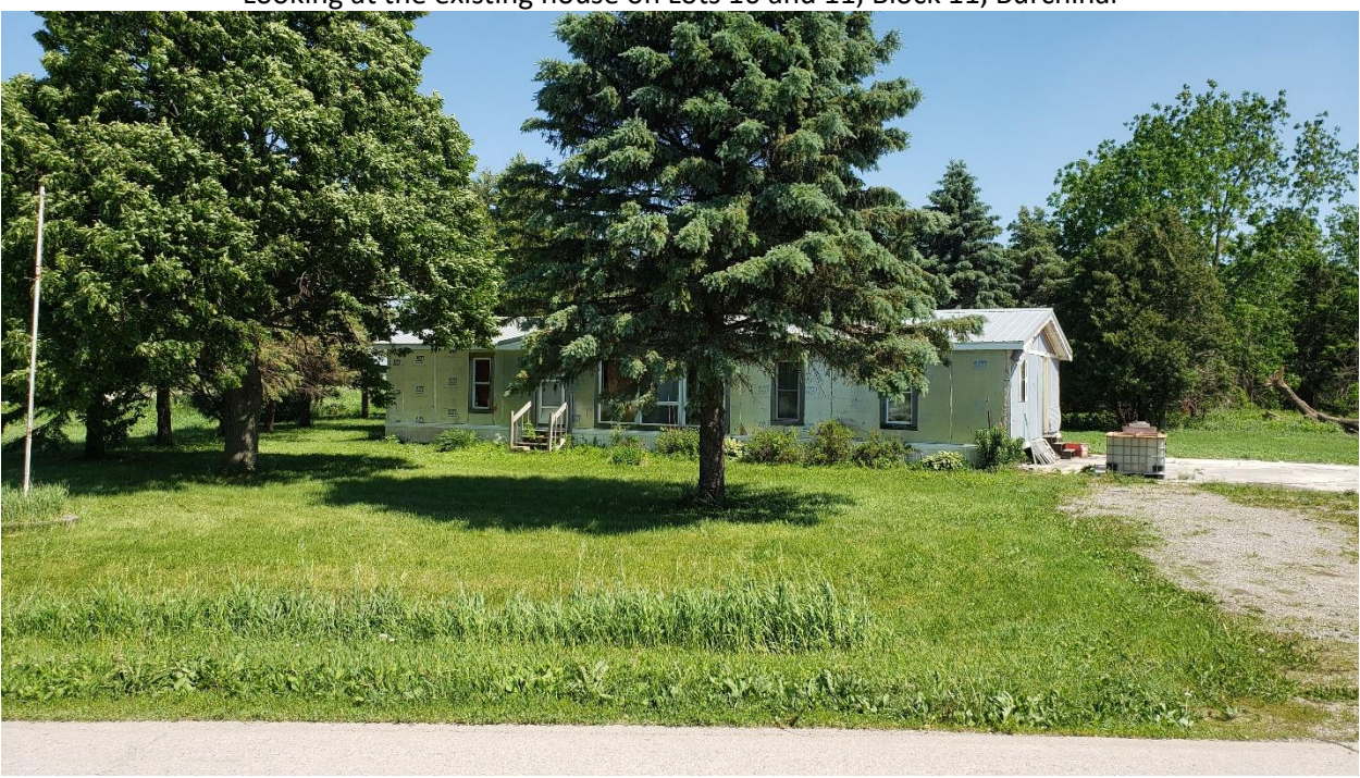
Figure 3 Looking at the existing house on Lots 10 and 11, Block 11, Burchinal