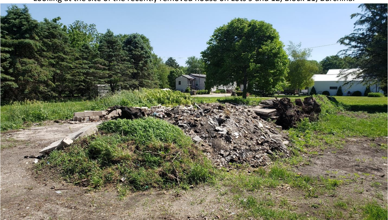
Figure 4 Looking at the site of the recently removed house on Lots 9 and 12, Block 11, Burchinal