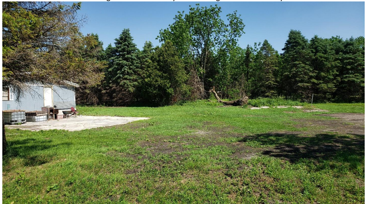
Figure 2 Looking north from Tiffany Street along the 20'-wide alley