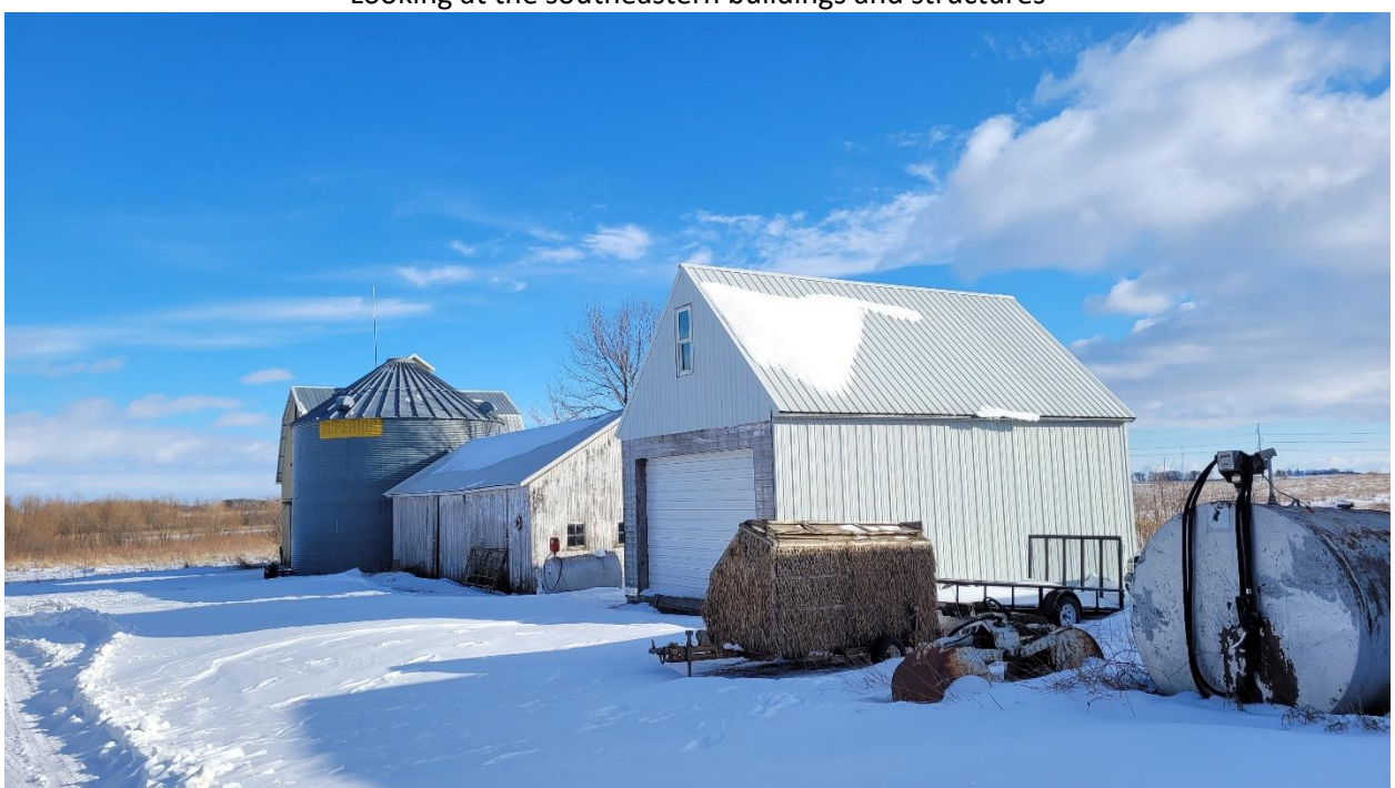
Figure 4 Looking at the southeastern buildings and structures