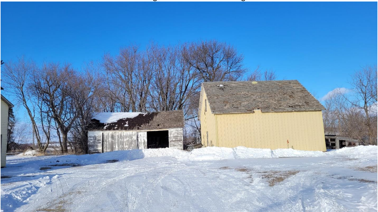
Figure 2 Looking at the northern buildings