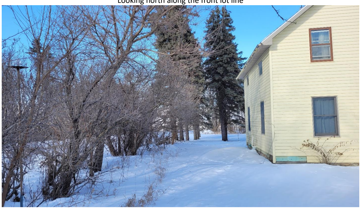
Figure 6 Looking north along the front lot line