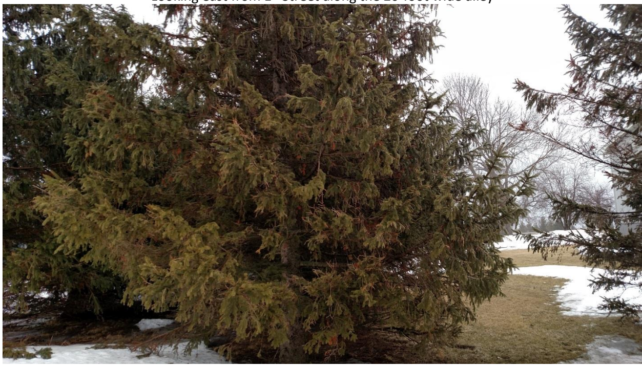
Figure 2 Looking east from 1<sup>st</sup> Street along the 20-foot wide alley