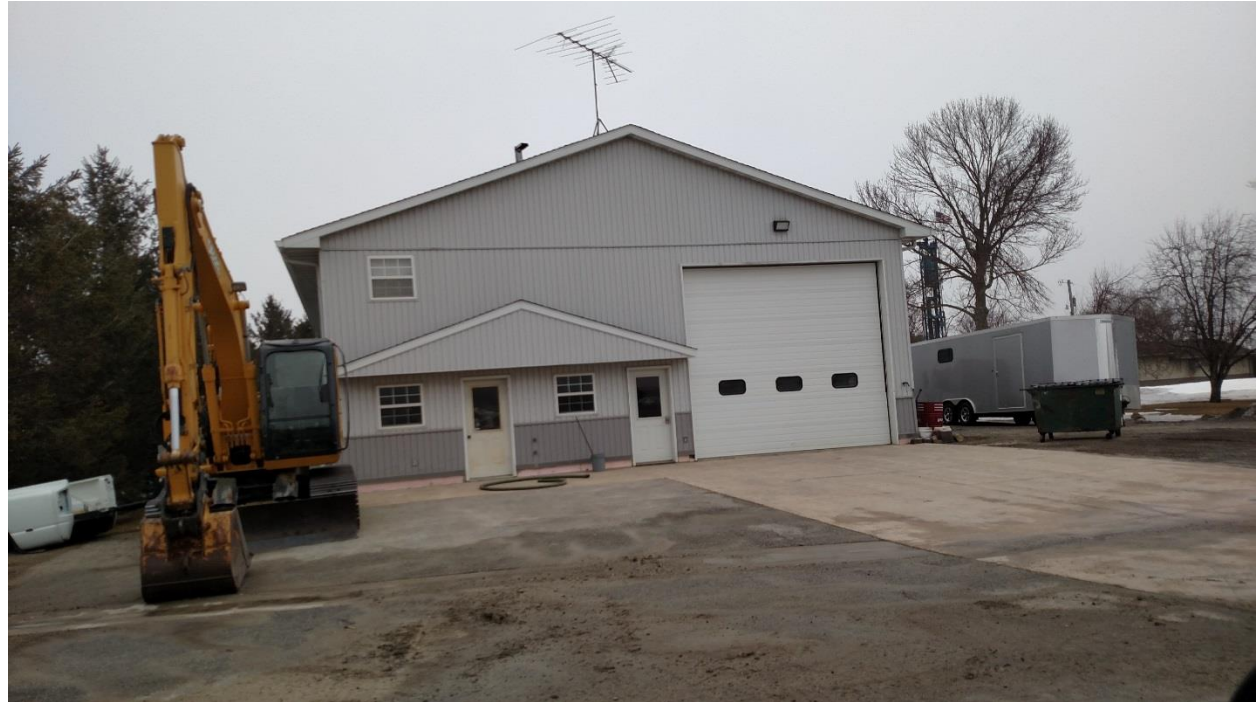
Figure 6 Looking at the utility building on Lots 15-18