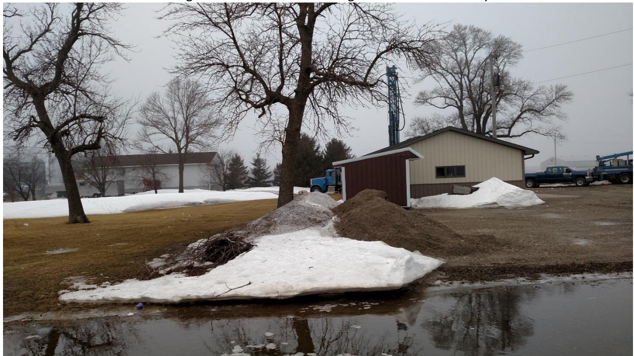
March 20, 2019

Figure 1 Looking west from 2<sup>nd</sup> Street along the 20-foot wide alley