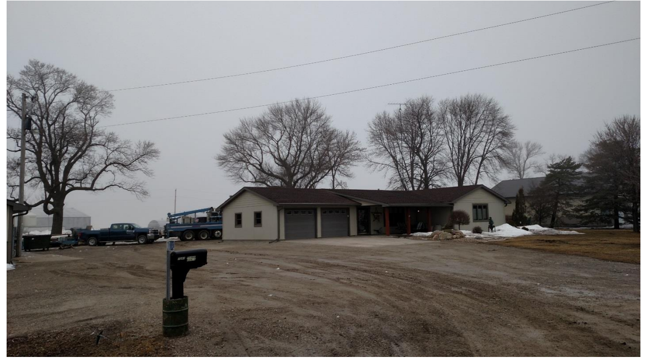
Figure 4 Looking at the house on Lots 3-6