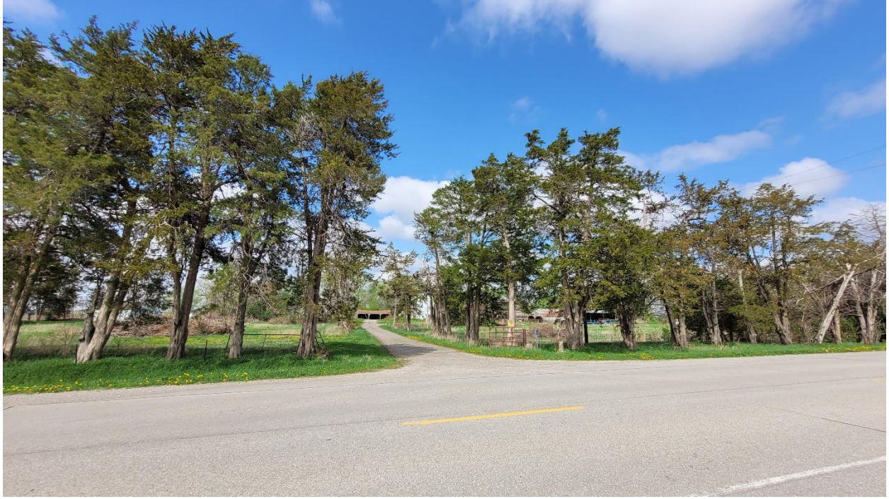
Figure 4 Looking at the 11636 Lark Avenue adjacent to the west of the subject property