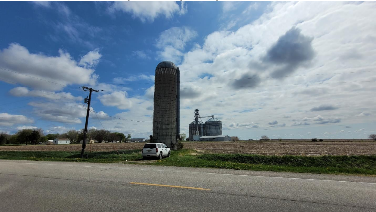
Figure 2 Looking at the existing silo and general location