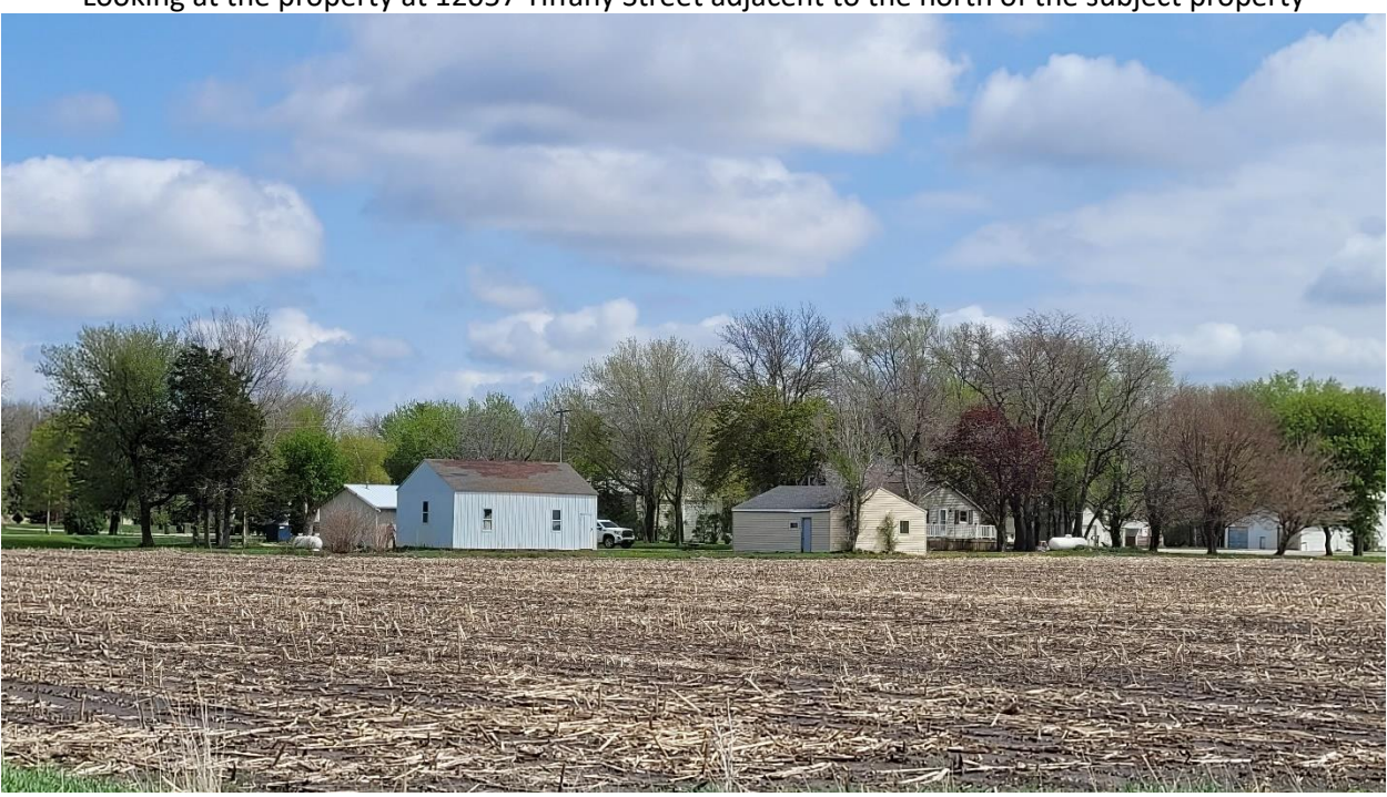
Figure 3 Looking at the property at 12057 Tiffany Street adjacent to the north of the subject property