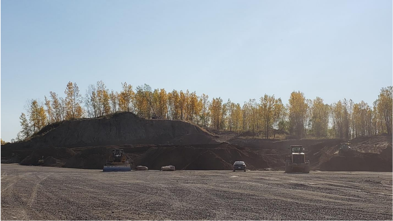
Figure 5 Looking at stockpiling of sand