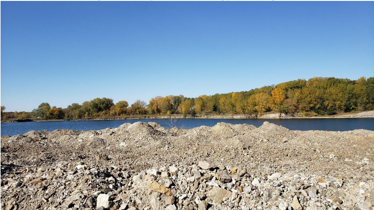
Figure 8 Looking southwesterly toward the existing pond and vegetation