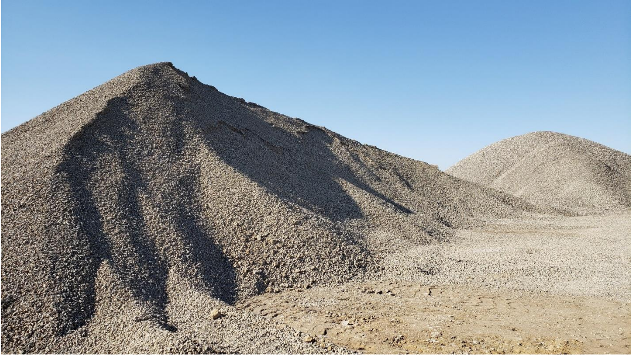
Figure 7 Looking at stockpiling of large gravel aggregate