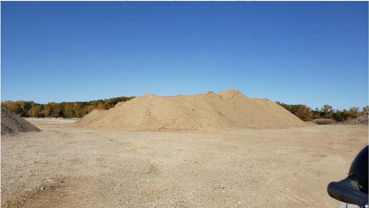
Figure 6 Looking at stockpiling of small gravel aggregate