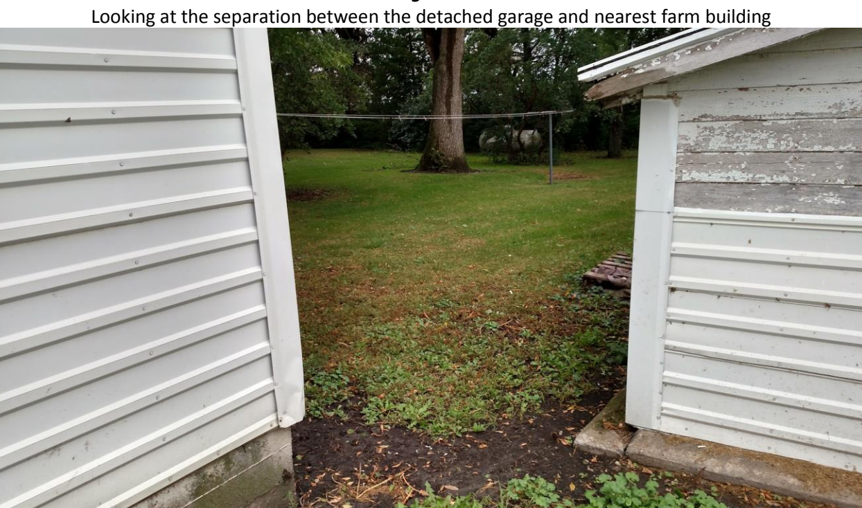
Figure 2 the detached garage and nearest farm build