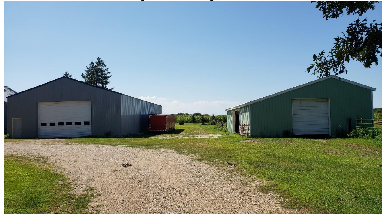
Figure 2 Looking at the two existing machine sheds