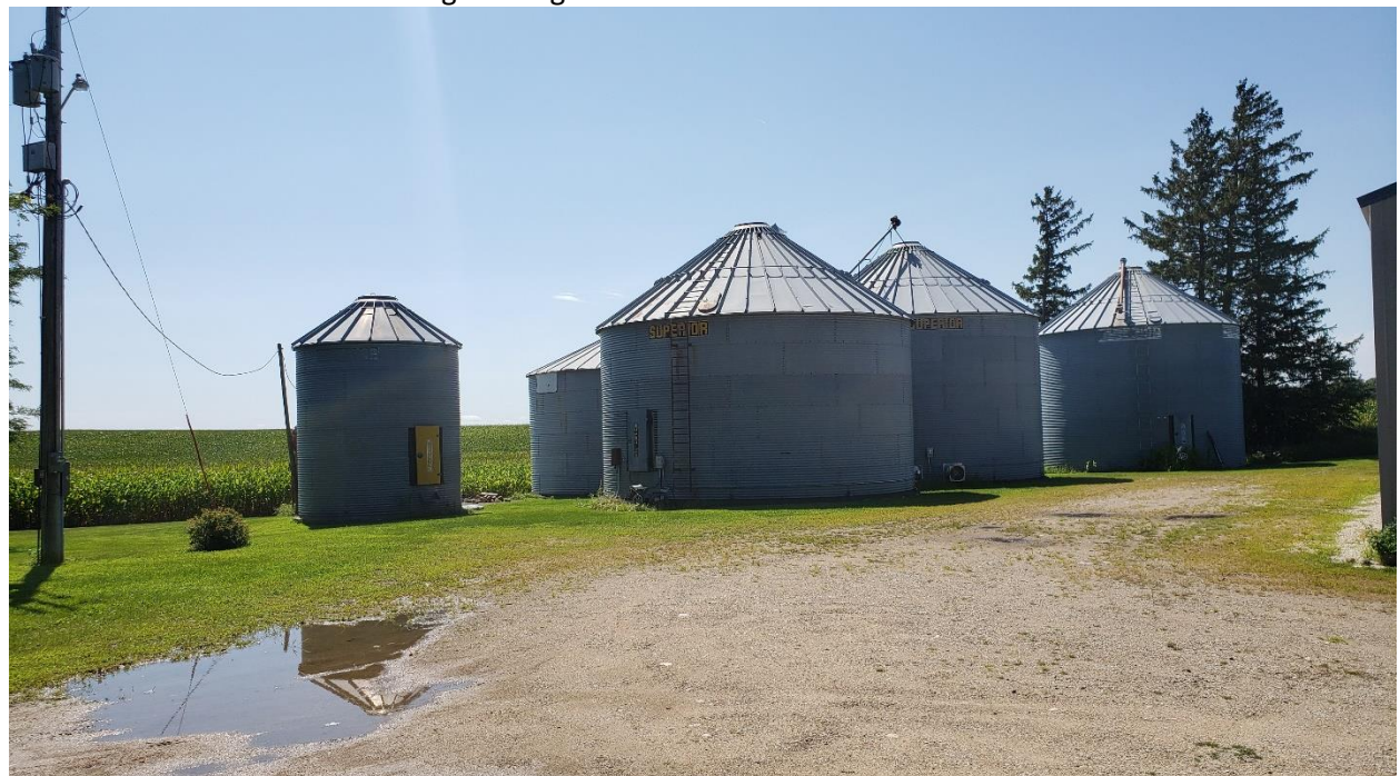
Figure 3 Looking at the grain bins south of the machine sheds