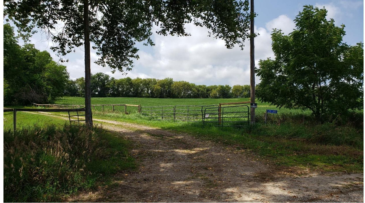
Figure 4 Looking at the driveway north of Brown's property accessing the surrounding land