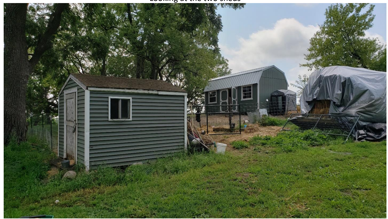
Figure 3 Looking at the two sheds