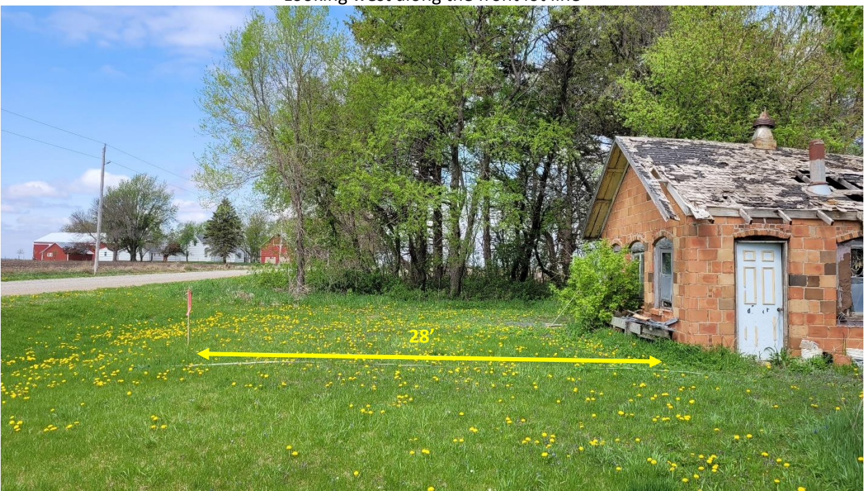
Figure 5 Looking west along the front lot line