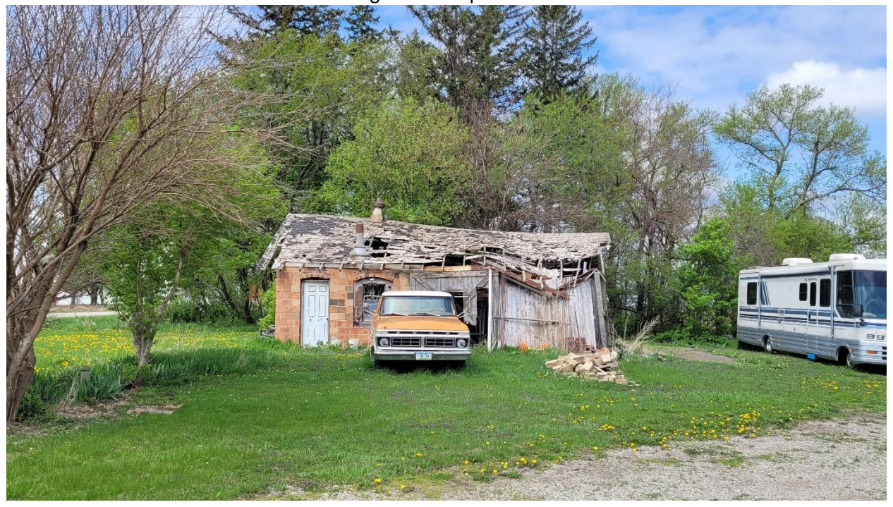
Figure 4 Looking at the dilapidated shed