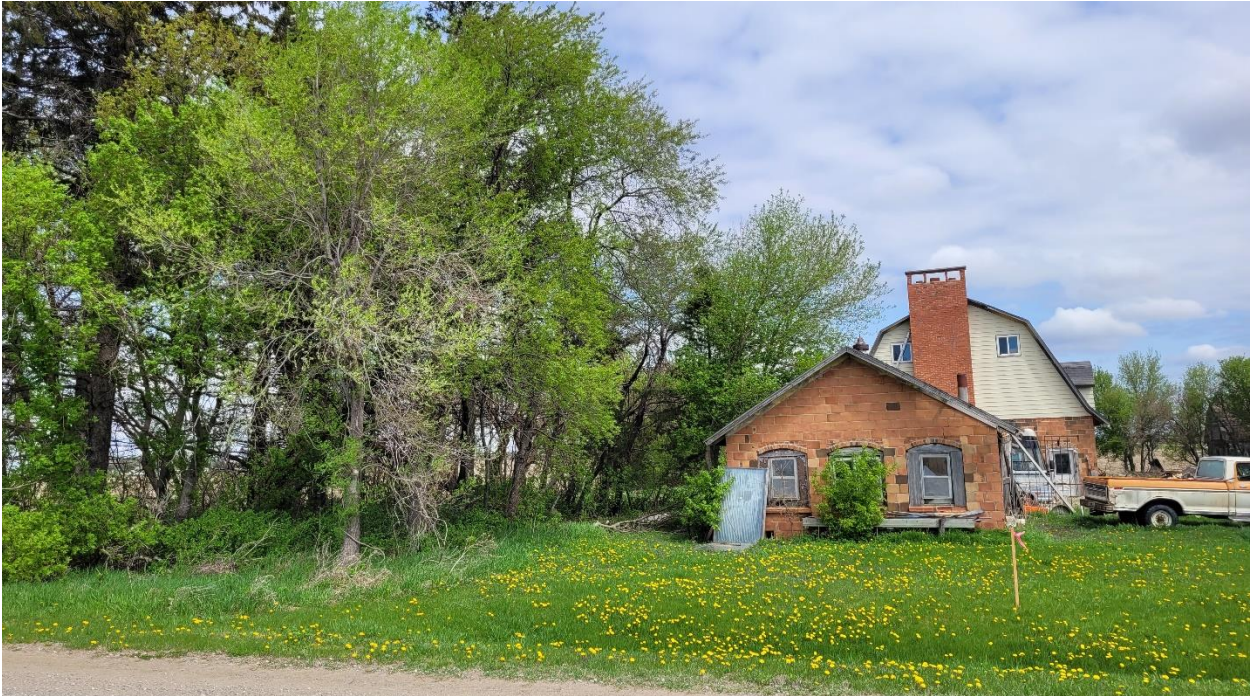
Figure 2 Looking at the area to be added to the original parcel