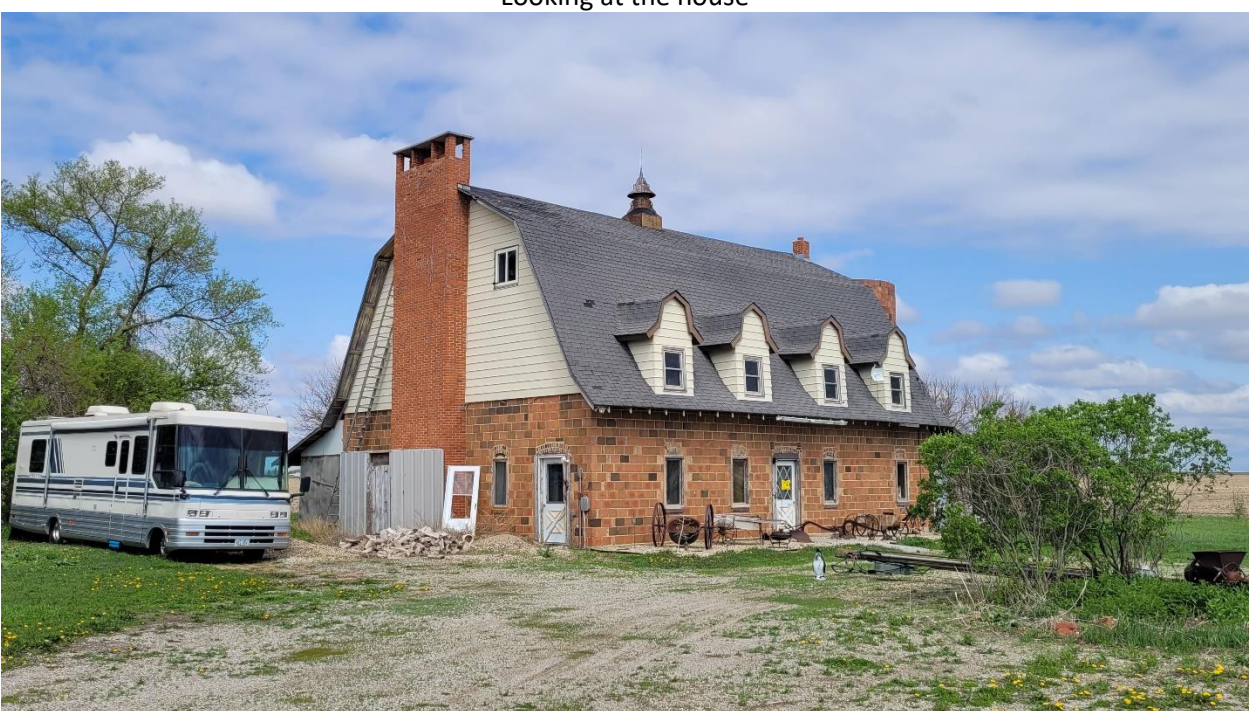
Figure 3 Looking at the house