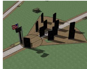
East Overhead View of Monument West