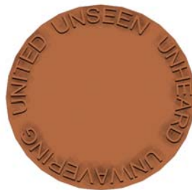
Center Piece Dial